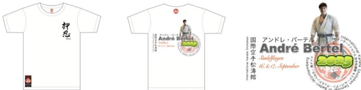
Front / Back / Logo

The shirts are issued at check-in on Saturday morning.